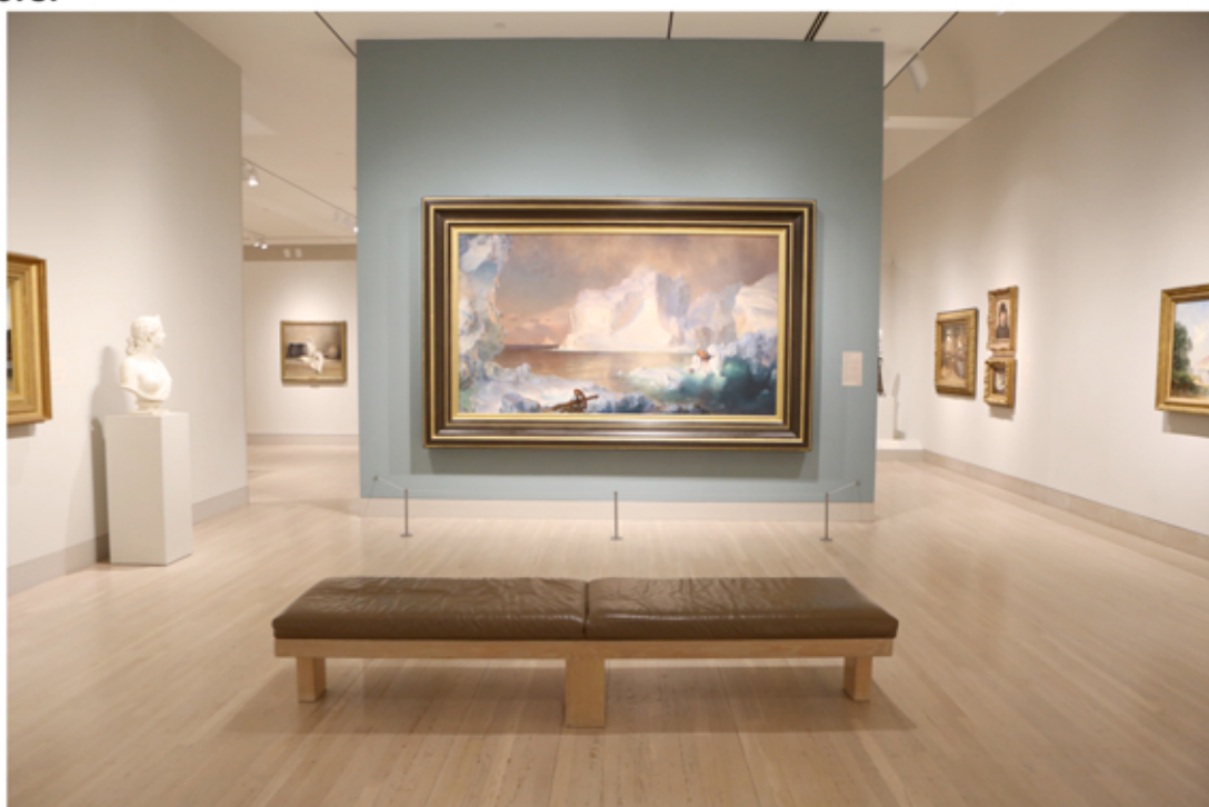
Dallas Museum Of Art