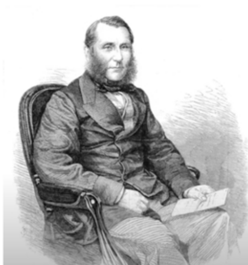
Sir EDWARD WATKIN