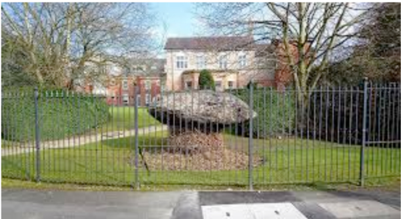
The Sharstone and Rose Hill House