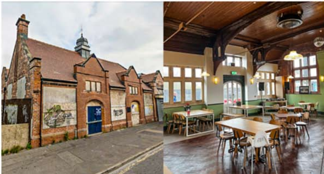
(The exterior when abandoned and the inside now)

For those of you who live near or in the Stockport area, you might be interested in a brilliant new café/bar opened on the A6 in Levenshulme. It is using the formerly derelict buildings of Levenshulme South Station, now beautifully restored. It's on Edward Watkin's 'Fallowfield Loop' and you can Google it under 'Station South'. It's really attractive for a meal or a drink and incorporates a cycle shop as well. The dream of the three people who thought up the idea was terrific and an act of faith. (One of their discoveries when they opened up the derelict building was a dead cow.) What is of special interest to the Watkin Society is their interest in the history of the station and its creator, Edward Watkin. We have already provided some Watkin material for an exhibition and may be able to hold a society meeting there in the new-year.